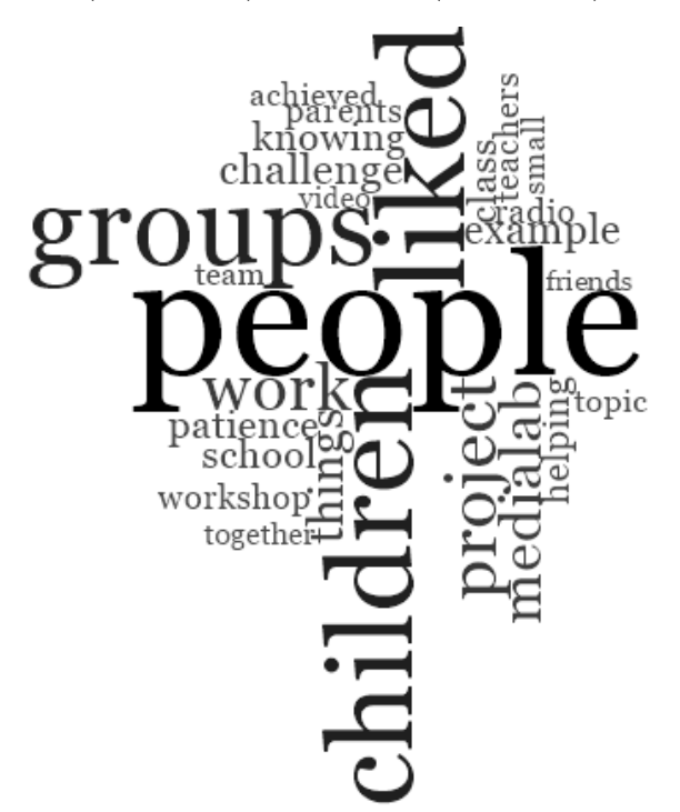
Figure 2. Word cloud of the positive aspects. Compiled by the authors.

We first obtained a word cloud using NVivo 11 with the goal of exploring what words appear frequently in the participants' discourse. As Figure 2 shows, the words that appear most frequently are: people (72 references), children (63 references), liked (49 references), groups (44 references), project (36 references), work (34 references) and Medialab (29 references).