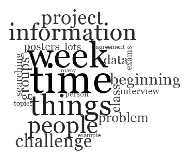
Figure 3. Word cloud of the problems and difficulties. Compiled by the authors.

Although the students were satisfied with the outcome, some limitations can be highlighted. First, and as was the case in the section on positive aspects, we produced a word cloud in order to find out which terms appeared most often when the students talked about difficulties. As Figure 3 shows, the words that appear most frequently are: time (53 references), week (47 references), things (39 references), information (32 references), people (27 references), project (27 references) and challenge (25 references).